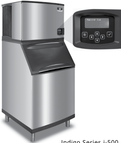
Indigo Series i-500 Ice Machine on B-570 Bin

Designed for operators who know that ice is critical to their business, the Indigo® Series ice machine's preventative diagnostics continually monitor itself for reliable ice production. Improvements in cleanability and programmability make your ice machine easy to own and less expensive to operate.