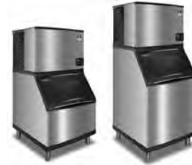
i-500 B-400 i-500 B-570