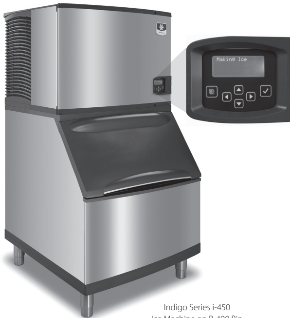
Indigo Series i-450 Ice Machine on B-400 Bin

Designed for operators who know that ice is critical to their business, the Indigo™ Series ice machine's preventative diagnostics continually monitor itself for reliable ice production. Improvements in cleanability and programmability make your ice machine easy to own and less expensive to operate.