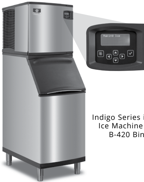
Indigo Series i-522 Ice Machine on B-420 Bin

Designed for operators who know that ice is critical to their business, the Indigo® Series ice machine's preventative diagnostics continually monitor itself for reliable ice production. Improvements in cleanability and programmability make your ice machine easy to own and less expensive to operate.